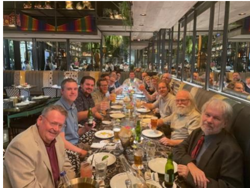
ATMI Dinner @ CMS/ATMI Conference, Miami, October 26-28, 2023.

Connect with us by emailing the details to dgoot@iu.edu , and you may find your achievements published in the next newsletter. We look forward to celebrating your successes and keeping our community vibrant!