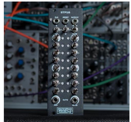
STP16 by MachineRoom

controls provide for sequencing flexibility and the CV offers options to reset the sequence and toggle between the gate and trigger modes.