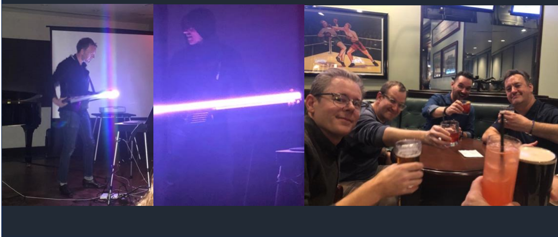
Images of ATMI Concert and Gathering at the National Conference in Washington, DC 2024